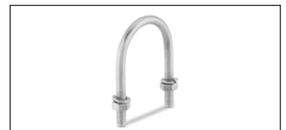
NORMAFIX® U-Bolt Clamp