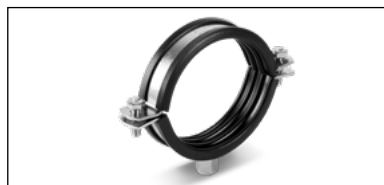
NORMAFIX® Isophonic Pipe Clamp