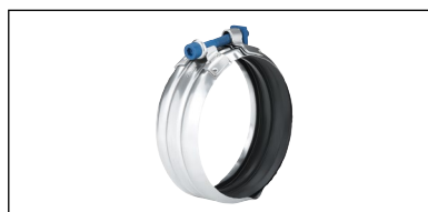
NORMACONNECT® DCS RAPID MSM

NORMACONNECT® DCS RAPID is part of a broad portfolio. Discover more!