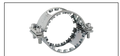
NORMACONNECT® DCS Combi Claw