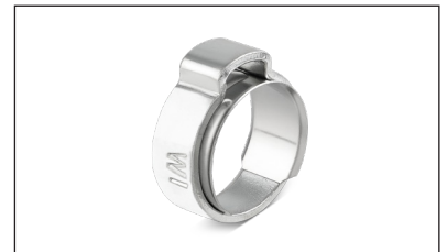
Ear clip safe