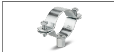
NORMAFIX® Reinforced Pipe Clamp

NORMAFIX® Isophonic Pipe Clamp is part of a broad portfolio. Discover more!